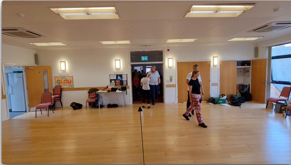
Entering from upstage entrance (Up the hill at back of space)