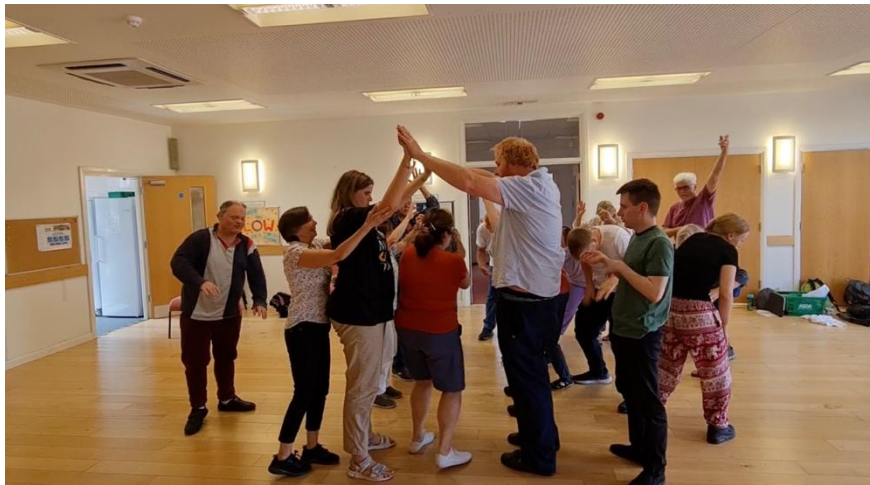
All join in house CREATION